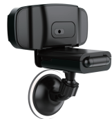
Setup on an adhesive disc