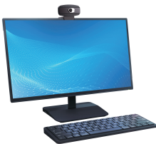
Setup on the top of a monitor